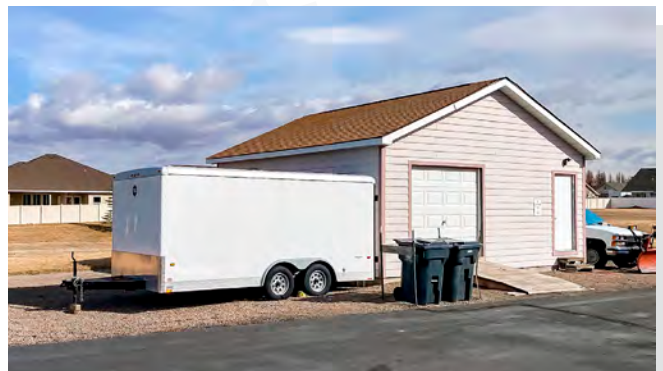
▲ Maintenance trailer parked at Our Saviors Lutheran in Twin Falls during the off-season.

In 2021, the health center was relocated to Snowyside Cabin to address health and safety concerns for campers and our medical staff, prioritized due to the COVID pandemic and now must be remodeled to include an ADA ramp, ADA bathroom, new windows and floors throughout (to replace the existing cement floor). These improvements will provide increased privacy and separation for sick campers as well as better facilities for those caring for them.